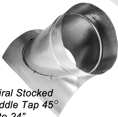
Spiral Stocked Saddle Tap 45° 4" to 24"