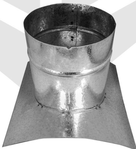
Spiral Stocked Saddle Tap 90° 4" to 24"