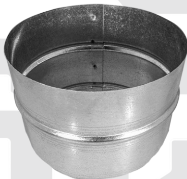
Spiral Duct Connectors 4" to 48"