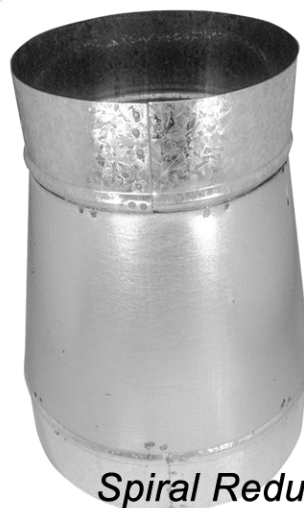
Spiral Reducer 4" to 24"