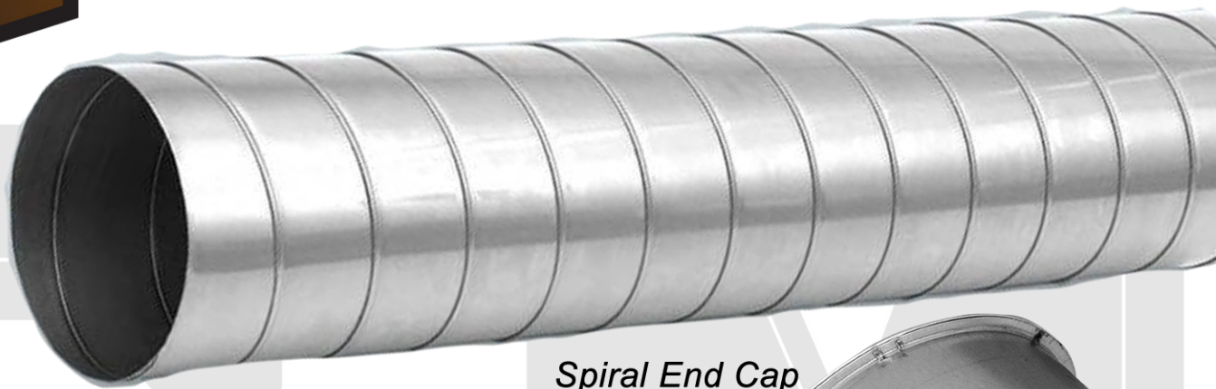
Spiral Duct Pipe 5" to 38" 22ga to 28ga