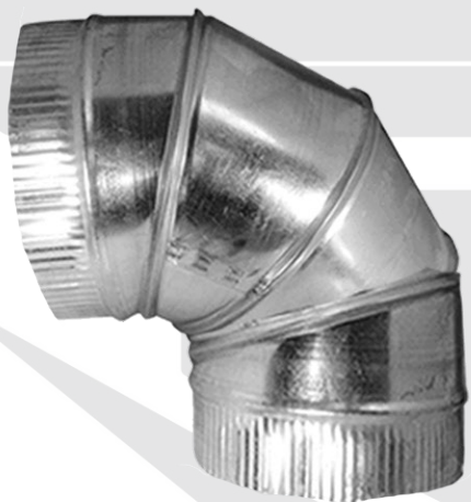
Spiral Elbow Short Radius 4" to 24" 90° to 45°