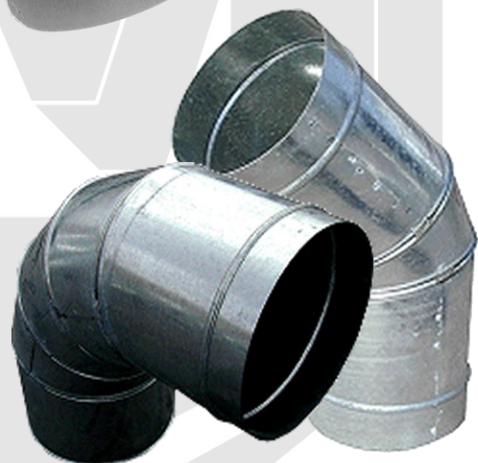
Spiral Elbow Long Radius 4" to 24" 90° to 45°