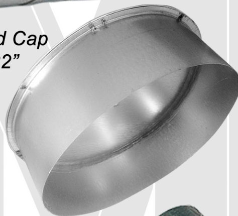
Spiral End Cap 4" to 22"