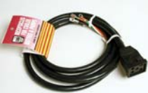
7595 / 7599 / 7591