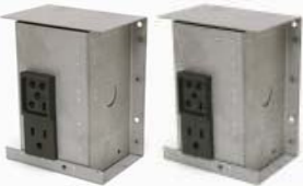
INTERIOR ELECTRICAL JUNCTION BOXES