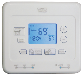
53200 5/1/1 Day Programmable