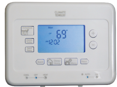
53300 7 Day Programmable